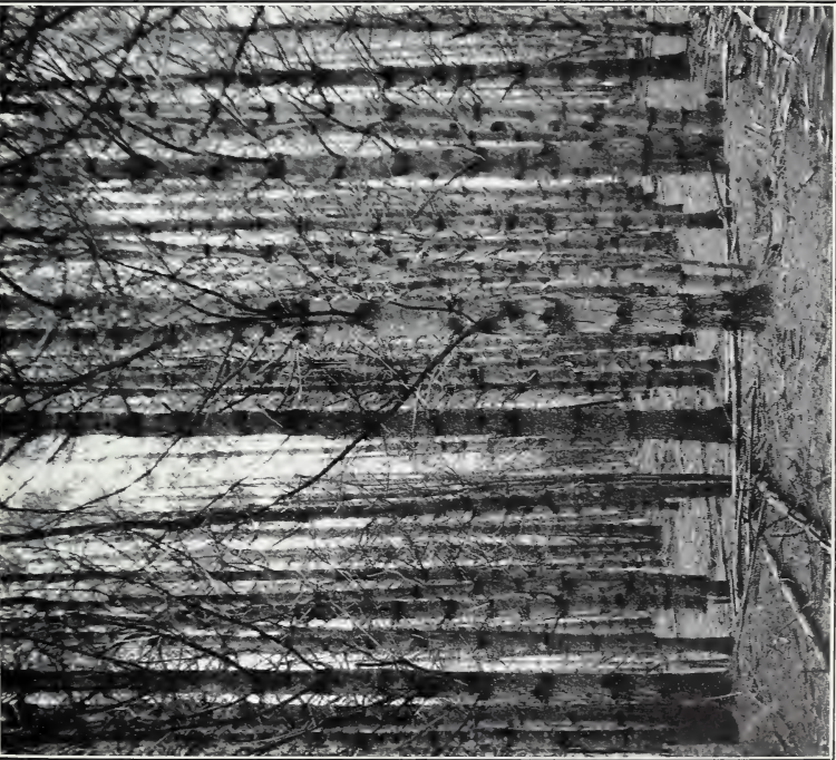
FIG. 1.—A 50-YEAR-OLD WHITE PINE STAND BEFORE THINNING. SOUTHERN NEW HAMPSHIRE.